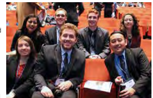
For more details see: nmun.org/awards-criteria.html .