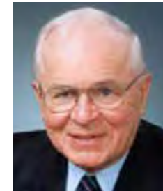
Hon. Douglas Roche