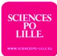
Sciences Po Lille, France

conference. UN facilities, including the General Assembly Hall, are generally used on the last day of our New York conferences.