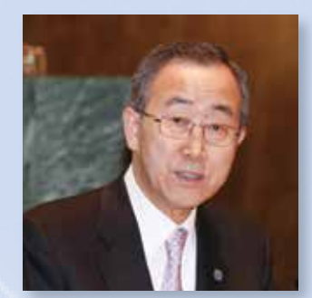
H.E. Ban Ki-moon UN Secretary-General

"The United Nations is a reflection of the world as it is. The United Nations is also a reflection of the world as it should be...Your job, in whatever pursuit you choose, is to diminish the gap between the world as it is and the world as it should be."