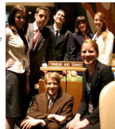
- NMUN•NY Delegation, University of Alaska-Fairbanks, USA

"Now our delegation members are better public speakers, have a firmer grasp on how to network, and a deeper understanding of how difficult but rewarding the work of the United Nations can be. There is no doubt that the NMUN Conference was an eye-opening experience that has changed the career course of some of our students."