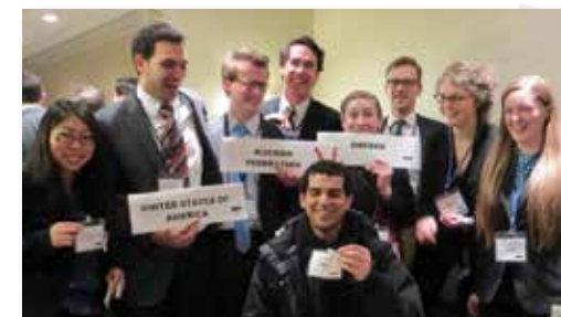
- NMUN•NY Delegation, EDHEC Business School, France

"Our goal is not to reach perfection, our goal is to try and initiate actions because empowering the people is the only way to resume optimism and answer today's issues, because the force of the group is stronger than the pessimism of a few....Thanks to you we were able to feel the magic of the United Nations."