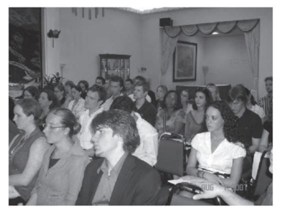
Osgood Center participants at the Chinese Embassy

"Leadership in a New Era" will bring participants from all over the world to Washington, DC to investigate the dynamics of a leadership transition in Washington. We will visit business, political, media, religious, and other cultural leaders to see how they are preparing for the future. We will bring in leadership trainers to give you insights to your own skills and leadership habits, and we will engage in vigorous discussions about alternative policies to confront the nation's most intractable problems such as energy, health, Middle East Peace, the rise of competitors, social security, terrorism, and more.