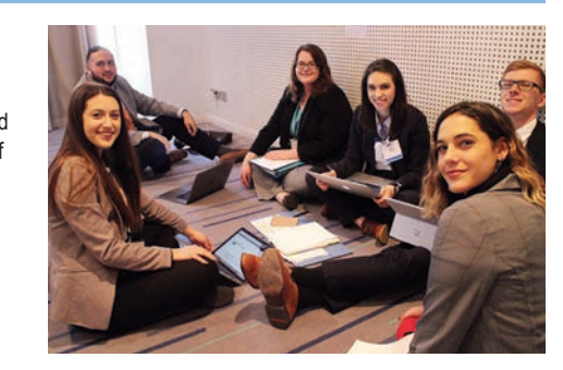
For more details see: nmun.org/awards-criteria.html.